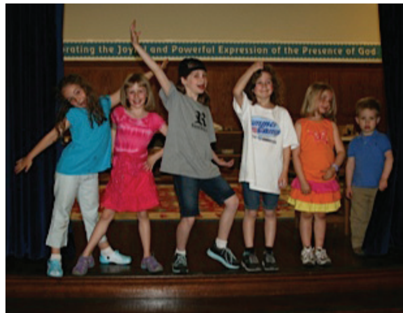
Our young people enjoying themselves at the Families with Kids Pentecost Picnic on May 19.

Car washes will be offered by our Teens in Action youth group on the first and fourth Sundays in June (June 2 and June 23). The suggested donation will be $5, and proceeds will help fund this summer's mission trip. Thank you in advance for your support!