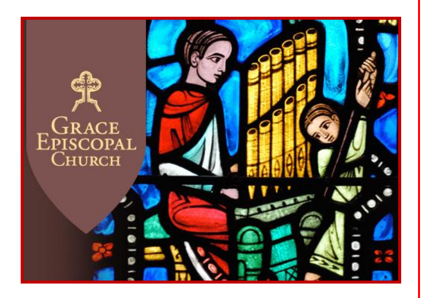
If your answer is YES to these questions, then Grace Church Choristers is the place for you!!