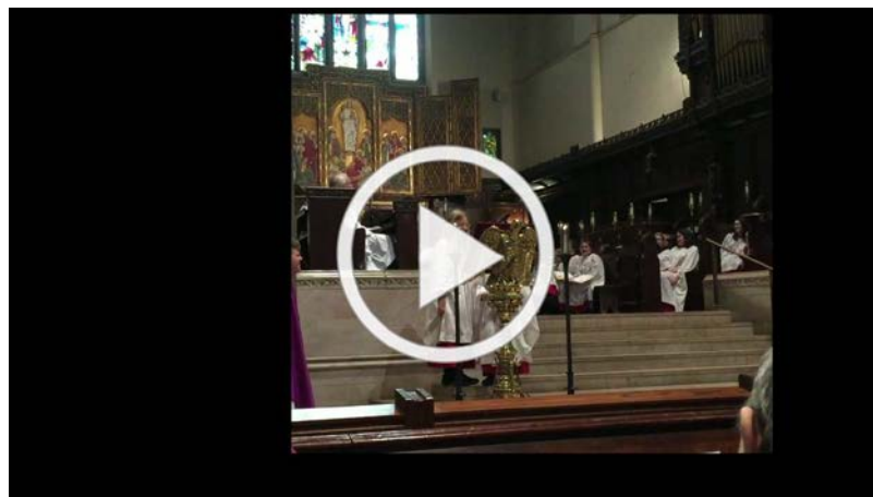
Nativity Pageant Announcement 2018

If you prefer to receive your invitation directly from some of the performers, have a look at this video below.