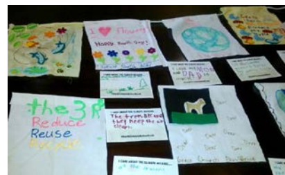
Prayer flags made by Sunday School kids for Faith Climate Action Week on April 23, 2017.