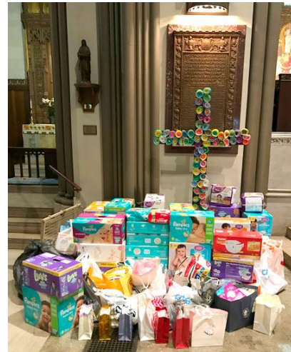
Children's Friend was thrilled with the scale of our 2017 Lenten Cross drive.

Parking for Worship: Parking for Sunday worship is provided in the lot diagonally across Westminster Street, on the NW corner of Westminster and Snow. A small number of spaces