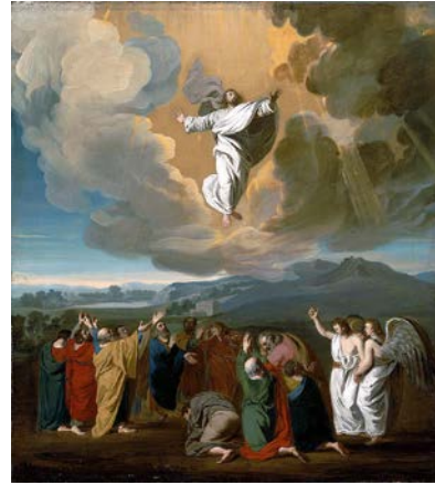
The Ascension, John Singleton Copley, 1775, Museum of Fine Arts, Boston, MA.

The Ascension of Jesus is also professed in the Apostles' Creed and the Nicene Creed: "He ascended into heaven and is seated at the right hand of the Father" (Book of Common Prayer, pp.120, 358).