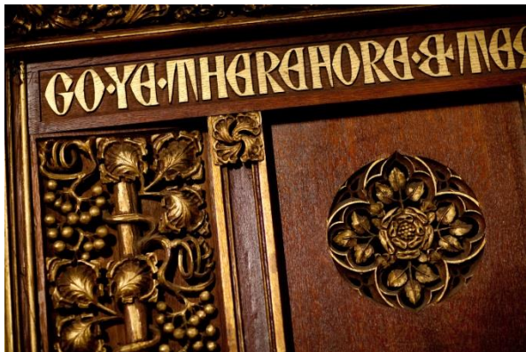
The Tree of Life