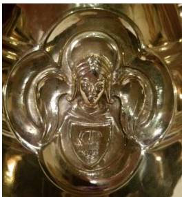
The Angel representing Saint Matthew at the base of the Altar Cross.

The medallion at the top of the panel to the right of the Altar Cross was the inspiration for the design of the Fireplace Window in The Pavilion and the Center Stone of The Labyrinth in the Courtyard Garden.