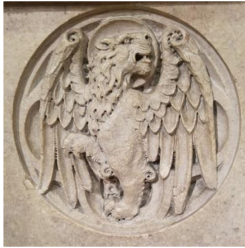
A Lion: Saint Mark