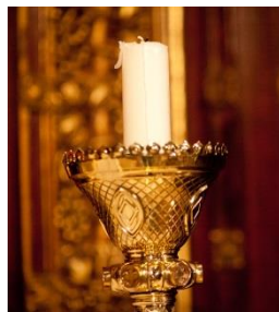
One of the Altar Candlesticks