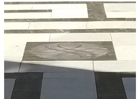
The Labyrinth Center Stone