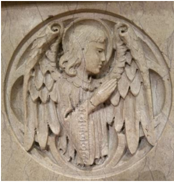
An Angel: Saint Matthew