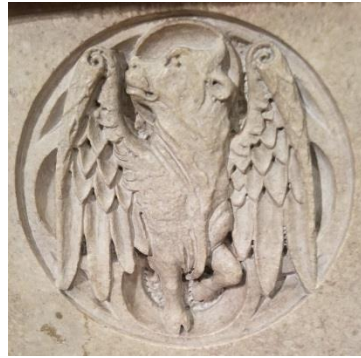
An Ox: Saint Luke