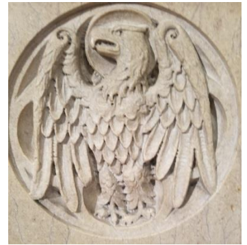
An Eagle: Saint John