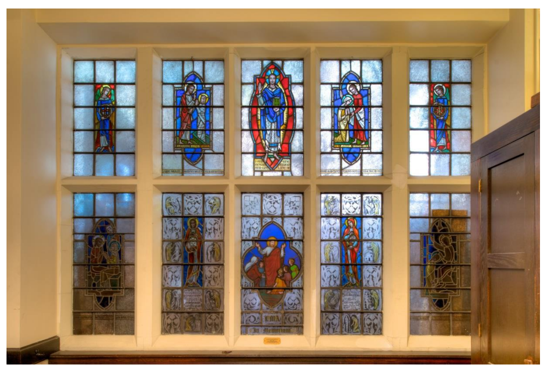
Above & Right: The Sacristy Stained Glass Windows by the firm of Charles J. Connick in Boston.