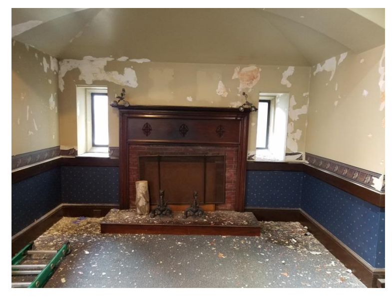
Above: The Chafee Room (circa 1950s)