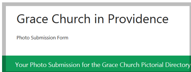
Photo submissions are already trickling in for our upcoming pictorial directory for Grace Church, but we'll need broad participation from our community to make a great result. Please submit your photo as soon as you're able.

Rather than scheduling portrait photography sessions, we're asking parishioners to either take their own portraits, or use any suitable recent portrait, and submit them to us using this simple web form . To have your photo included, please submit your photo no later than November 1st . Please submit only one photo per household.