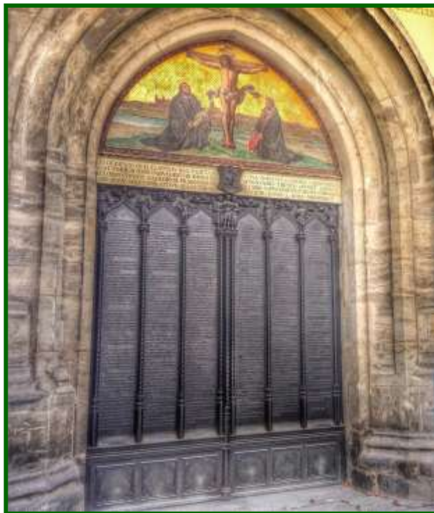
The doors of the Schloßkirche in Wittenberg, Germany with Luther's 95 Theses reproduced in bronze.