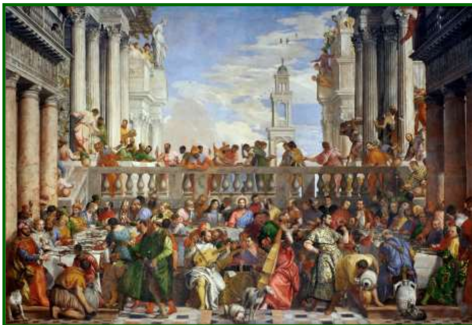
The Wedding Feast at Cana, Paolo Veronese (1528-1588)

Please join in singing the Agnus Dei on the following page.